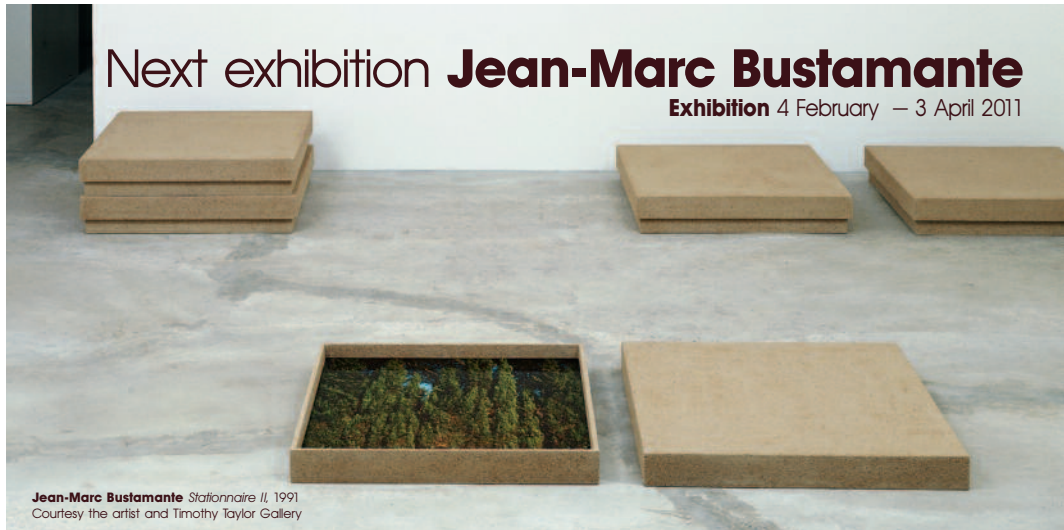
Jean-Marc Bustamante Stationnaire II, 1991