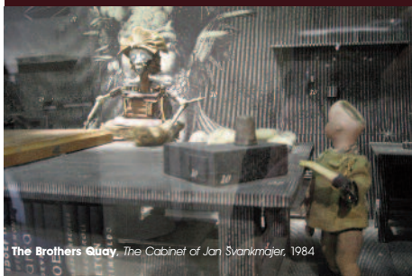
The Brothers Quay, The Cabinet of Jan Svankmajer , 1984